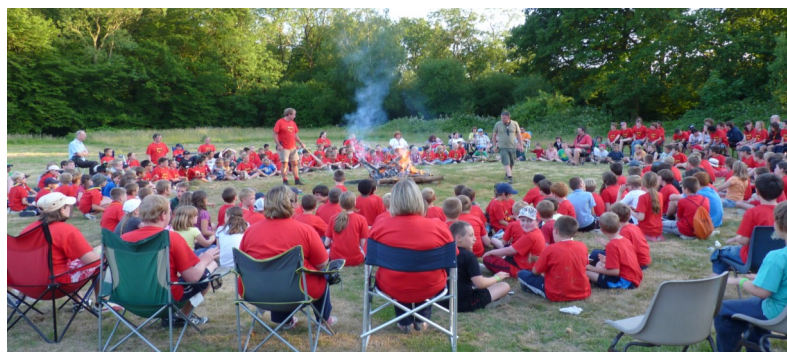
Harlow District enjoying a campfire during their Centenary Camp