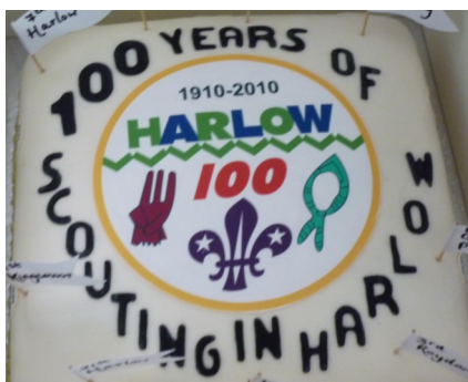
Birthday cake shared at Centenary Camp

4 members of 16 th Harlow gained the Scout Entrepreneur badge, these were amongst the first in the country to receive this new badge.