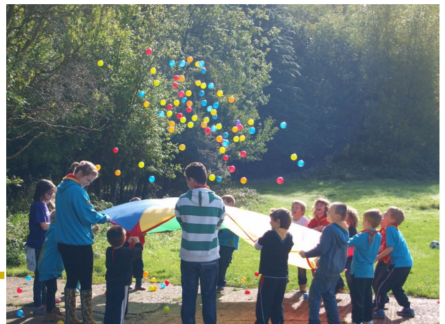
16th Harlow & 2nd Great Parndon Beavers having fun on their sleepover

I am hoping that the new Explorer Unit will meet at Risdens providing more availability to Scouts from the Troop who can then become Young Leaders with our Scout Troop